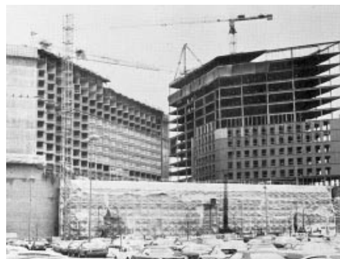
All-Weather Building Enclosures.