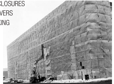
All-Weather Building Enclosures.